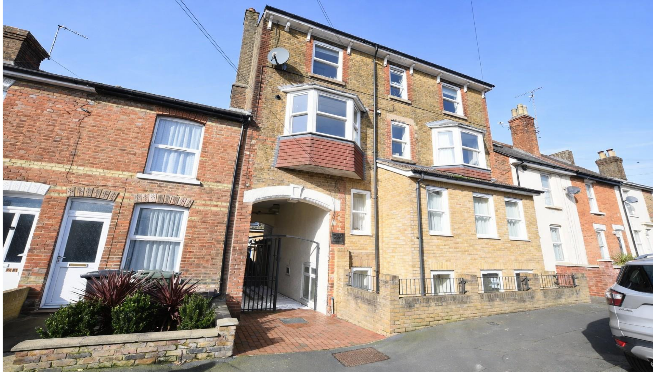
Flat 1 Hedley Court, 27 Hedley Street Maidstone ME14 5GE Price £155,000